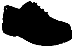
5. Black Nu Buck 5B. Brown Nu Buck