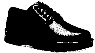
6. Brown Leather 7. Black Leather