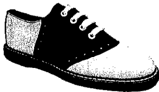
8. Black & White Saddle