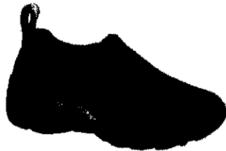
15. Brown Jungle Moc 15B. Black Leather Jungle Moc