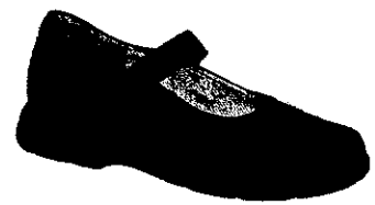
12. Black Leather