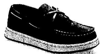
21. Sperry Cup