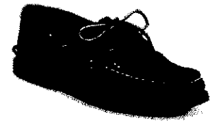
18. Sperry A/O (Authentic Original)