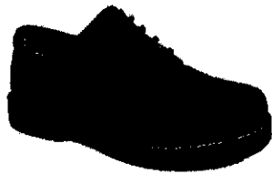
4. Tan Suede Buck