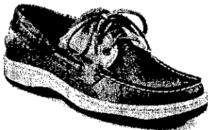
19. Sperry Billfish