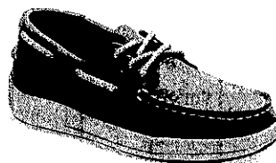
20. Sperry Gamefish