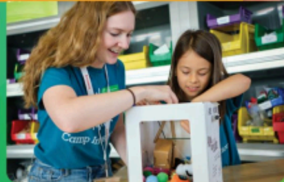
An Instructor empowers a third grader to build creative problem-solving skills while designing her own claw machine.