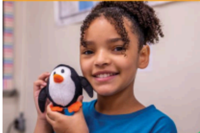
A fourth grader finds fun in physics with her magnetic penguin pal.