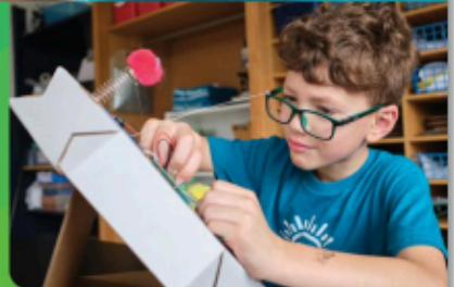
A second grader gains confidence as he wires his transmitter and sends Morse code messages.