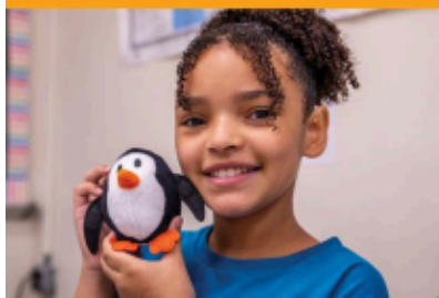
A fourth grader finds fun in physics with her magnetic penguin pal.