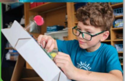
A second grader gains confidence as he wires his transmitter and sends Morse code messages.