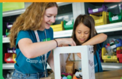
An Instructor empowers a third grader to build creative problem-solving skills while designing her own claw machine.